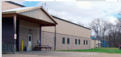
HB Carbide Company, Lewiston/Michigan

Star SU LLC 5200 Prairie Stone Parkway, Suite 100 Hoffman Estates, IL 60192 USA Tel.: 847 649 1450 Fax: 847 649 0112 sales@star-su.com