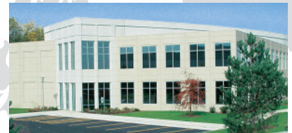
Star SU LLC, Hoffman Estates/Illinois